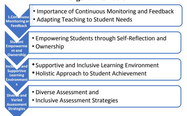
Figure 7: Student Teacher Reflection

Continuous monitoring and timely feedback are essential for student success, enabling teachers to adjust instruction to meet evolving needs. Hattie and Timperley [55, 72] emphasize that specific, timely feedback boosts achievement, while Hattie and Gan [17] highlight the value of formative assessment in improving outcomes. Participants P1, P2, and P3 echoed this, noting that ongoing assessment motivates students and supports instructional adjustments for diverse learners.