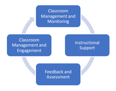
Figure 4: Facilitating Homework

Homework Management & Clarit, (3) Homework Management & Long-term Learning. Primary focus: Long-term assignments, reflection tasks, and advanced learning preparation, and (4) Homework Monitoring & Task Understanding.