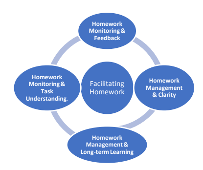
Figure 3: Emergent Framework on Facilitating Examination

Cooperating teachers employ a range of effective strategies to manage and assess examinations, ensuring a smooth and testing environment. Strong supportive classroom management is evident through controlled environments that minimize distractions, prevent cheating, and keep students focused—practices such as strategic seating, constant circulation, and time checks support academic integrity [27][28]. Student teachers noted these behaviors, observing teachers arranging seats to avoid cheating and monitoring student progress closely [P1, P2, P4, P5]. Instructional support before and during exams also plays a key role, with teachers providing clear instructions, addressing student concerns, and explaining test formats to reduce anxiety and enhance comprehension [30, 31]. Observations confirm that cooperating teachers clarified exam tasks and addressed individual student questions when needed [P3, P7, P8, P10].