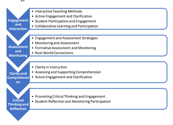
Figure 1: Emergent Framework in Monitoring Seatwork

Student teachers observed that cooperating teachers employed four key strategies during seatwork: active engagement and real-time feedback to keep students focused and reinforce learning [73, 74]; balancing support with autonomy to encourage problem-solving and independent thinking [14][57]; using formative assessments like checklists and individual evaluations to monitor progress and guide instruction [17, 75]; and applying classroom management techniques such as timers and behavioral monitoring to ensure productivity [18, 72]. Additionally, to enhance student comprehension during discussions, cooperating teachers used questioning techniques, formative assessments, and non-verbal cues to actively engage students, monitor understanding, and promote critical thinking [22, 23].